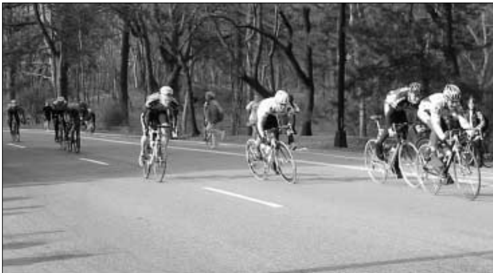
The A race field sprinting for points during the March 29th points race.

Also, if you know of a business that might be interested in contributing to the celebration, perhaps to get T-shirts for the kids at our clinic with an additional cash donation to the Conservancy, let me know (tel 212 362-1608, email publicrelations@crca.net ). They are doing a lot of publicity about the event and there will be much larger publicity of contributors than in the past, including some signs in the park on the 19th.